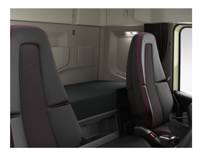
ROBUST TRIM. Vinyl upholstery. Raven rubber mats.

Choose between the three trim levels Robust, Dynamic and Progressive – see description below. On top of this, you can choose from a wide range of colours. You'll find your style. To fully explore the different interior trim levels, use the Volvo Truck Builder on www.volvotrucks.com