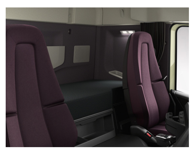
DYNAMIC TRIM. Textile upholstery. Raven rubber mats.