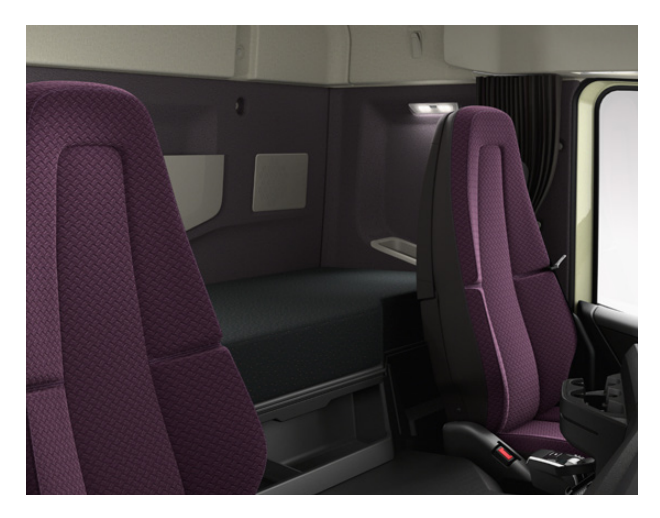
PROGRESSIVE TRIM. Plush or leather upholstery. Raven rubber mats.